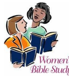
Women's Bible Study

The Ladies' Bible Class meets on Wednesday nights from 6:00 pm - 7:00 pm in room 17. The ladies are studying 12 Daring Women of the Bible .